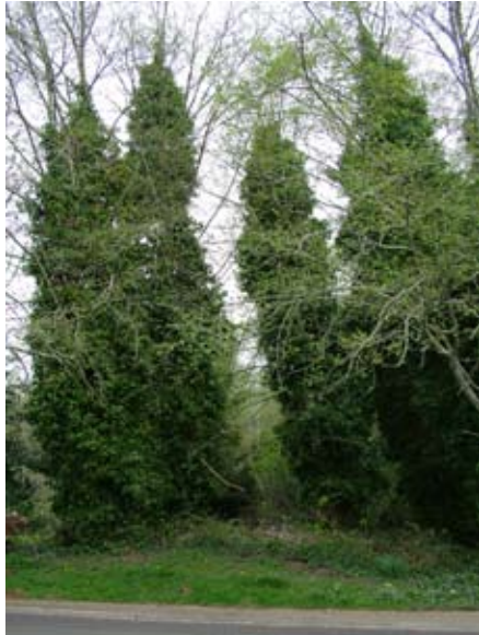
Figure 1.—Ivy can kill large overstory trees.

Ivy is an evergreen vine with thick, waxy leaves and distinct immature and mature growth stages. The immature, vegetative stage grows rapidly both along the ground or climbing, in shade or sun. Its leaves are dark green, with three to five